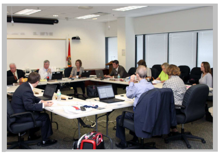
July 2012 meeting of the Probable Cause Panel in Tallahassee.

*Check the website for meeting times and locations.